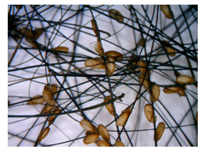
Figure 1: Eggs of Haematopinus tuberculatus glued to hairshaft of a buffalo (x16).

Since herd-level parasitic infections can be most precisely assessed using quantitative parasitological values, the Quantitative Parasitology software (QP 3.0) developed by Rózsa et al. [45] and Reiczigel et al. [46] was used during our studies.