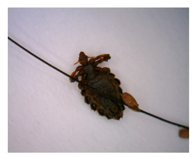
Figure 2: Haematopinus tuberculatus female (x11.7).

samples from the buffalo heifers yielded 12 adult lice, two larvae and 641 louse eggs, while from those of young males seven adult lice and 16 louse eggs were recovered. The hair samples collected from animals without an ear-tag number yielded three adult lice and 18 louse eggs. These buffaloes did not have an identification within SIRIC (the System of Individual Registration and Identification of Cattle). Most of the infested buffalo cows were in the age category of 3 to 11 years.