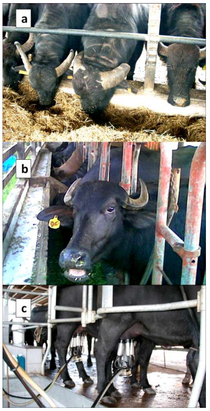
Figure 2: Intensive system of dairy buffalo, area of the Bajo Cauca, towns (municipalities) of Caucasia (Antioquia department), Planeta Rica (Córdoba department) and Puerto Boyacá (Boyacá Department), Colombia. Animals are kept indoorsure (a, b) and machine-milked (c).

Indeed, housing conditions are an indirect indicator of buffalo welfare, for if they do not include environmental enrichment, they will generate stress in the animals [16] (Figure 2a and 2b).