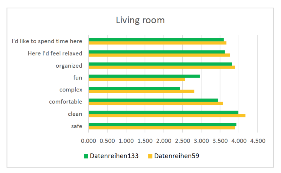
Figure 5: The results of the questionnaire for living rooms.

assume that less complex living space with defined functions may help men to have better experience in it (see Figure 5).