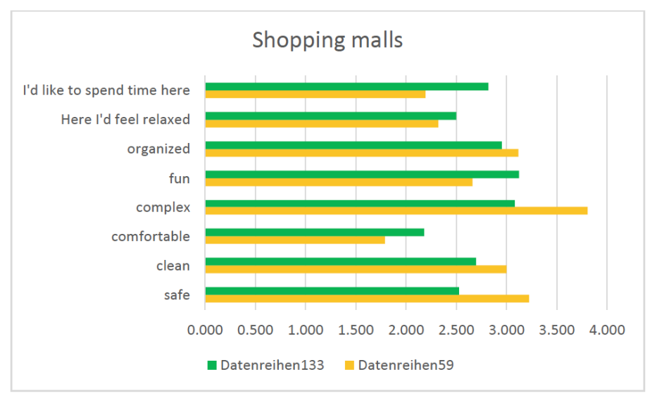
Figure 2: The results of the questionnaire for shopping malls.

Regarding the results of the workspaces, the questionnaire finished as expected. Both genders' decisions about construction sites were lower than the other workspaces, although the results of men were slightly higher than the results of women (see Figure