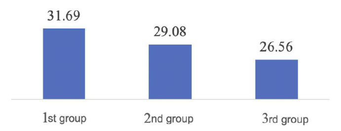
Figure 4: Quantitative data (%) of positive national identity of students in the studied groups, n = 527.

isolationism, national fanaticism), which deviate from the norm, were identified in a small number of respondents, namely in 13.29% The quantitative data of positive national identity and transformations of the latter in the studied groups of respondents are presented and characterised below, in particular, the quantitative data of the positive national identity of students of the studied groups are presented in Figure 4 for clarity.