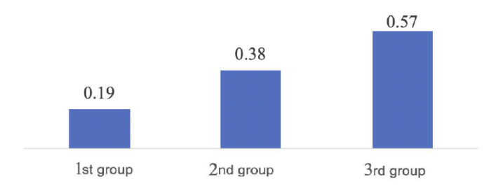
Figure 8: Quantitative data (%) of national isolationism of students in the studied groups, n = 527.

Figure 7 shows that few respondents are characterised by national egoism, namely - 0.19% in the 1st group (the smallest number), 0.38% in the 2nd (slightly more) and 0.76% in the 3rd (slightly more). National egoism is expressed in the acceptance by an individual of his nation, in the recognition of its right to solve its own problems at the expense of other, "foreign" nations, as well as irritation and tension in interactions with representatives of the latter. Respondents with this type of transformed national identity are confident in the superiority of their nation over others and prefer its way of life. According to them, interaction with representatives of other nations often leads to trouble, and therefore they lose their temper when communicating closely with them, feel tension, hearing foreign speech around them. For clarity, the quantitative data of the national isolationism of students in the studied groups are presented in Figure 8.