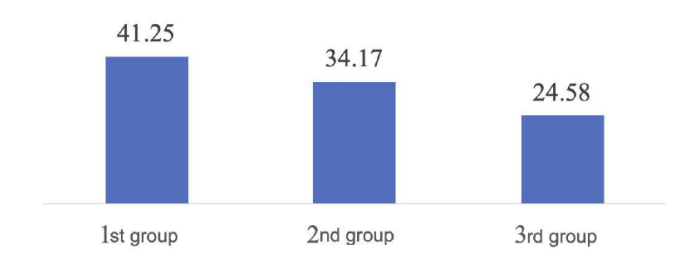
Figure 1: Quantitative data (%) of the relevance of the national identity of students in the studied groups, n = 240.

Quantitative data of relevance in the studied groups for the purpose of clarity are presented in Figure 1.