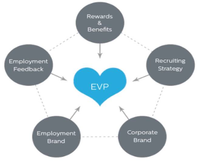
Figure 1: Variables of an EVP.

functioning, well-being of the employees and for obtaining results. There are variables associated with the value proposition, and all of them are crucial for talent to be drawn into the firm, and the existing ones remain. The organization must have well defined a recruitment plan, where it must be put in place to make the results visible. Concerning the corporate brand, it is also essential that it be well defined according to the organizational culture of the company. Also, employer branding is a strategy currently adopted by some companies that aim to stand out and remain in the market vis-a-vis competitors. The feedback given both internally and externally makes it possible for people to have a good perception of the organization.